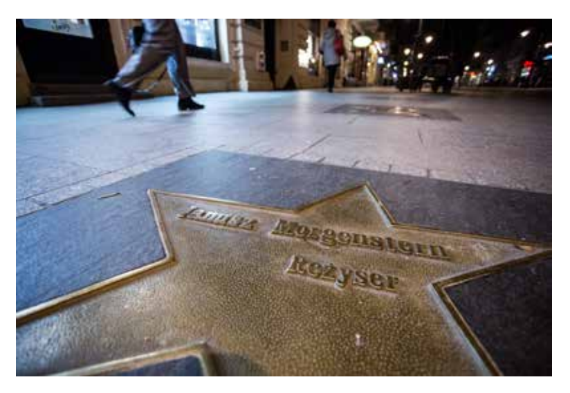
Fig. 1. The star of the director Janusz Morgernstern in the Łódź Walk of Fame

this was a place for Polish artists working at the Feature Film Studio (29 Łąkowa Street) to stay the night. In the view of Michael Goddard, the mediating of the film history of Łódź by the Walk of Fame leads to the following result: the idea which was supposed to be promoted by this product became parodied and musealised.<sup>21</sup> Thus, the Walk of Fame becomes a list of Polish film personages, most of whom did not make it to cross the threshold of Hollywood, in spite of what the adoption of the model of stars with names might suggest.