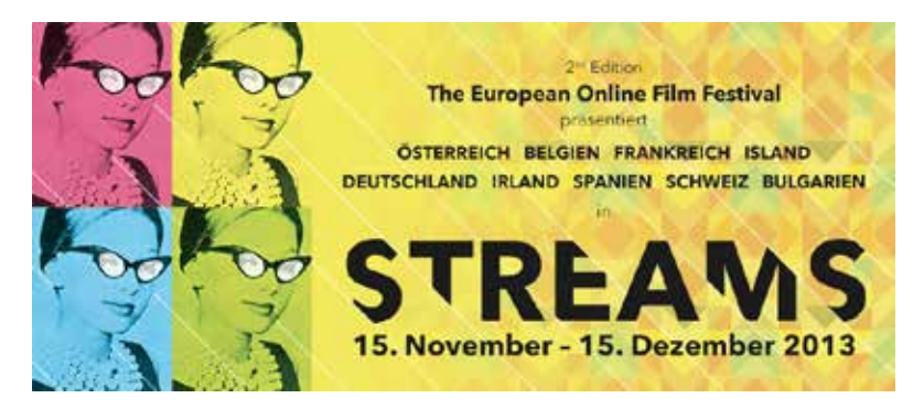
Fig. 1. Promotional banner for Streams 2013, <http://elementpictures.ie/ wp-content/uploads/streams-2013-headerpic-v05-de.jpg> [accessed 14 February 2016].

the site participated in the second edition of Streams: The European Online Film Festival. It was presented through the EuroVoD platform, a collaborative European video-on-demand network, specializing in European arthouse films and independent cinema.<sup>12</sup> In its second edition, Streams included films from Austria, Belgium, Bulgaria, France, Iceland, Ireland, Spain, Switzerland, and the UK, featuring a variety of genres and topics. From mid-November to mid-December, the films were available across all participating platforms. A jury, comprised of film critics and bloggers, representative of each of the contributing countries, awarded prizes for the best entries.<sup>13</sup> Thus, in theory, Streams portrayed a collaborative effort between European countries, aiming to uncover new opportunities for disseminating their festival pictures through digital distribution. A practical evaluation of Bulgaria's participation in Streams suggests that online festivals hold the potential to change the way the film industry functions but only when part of a larger network and under the right management.