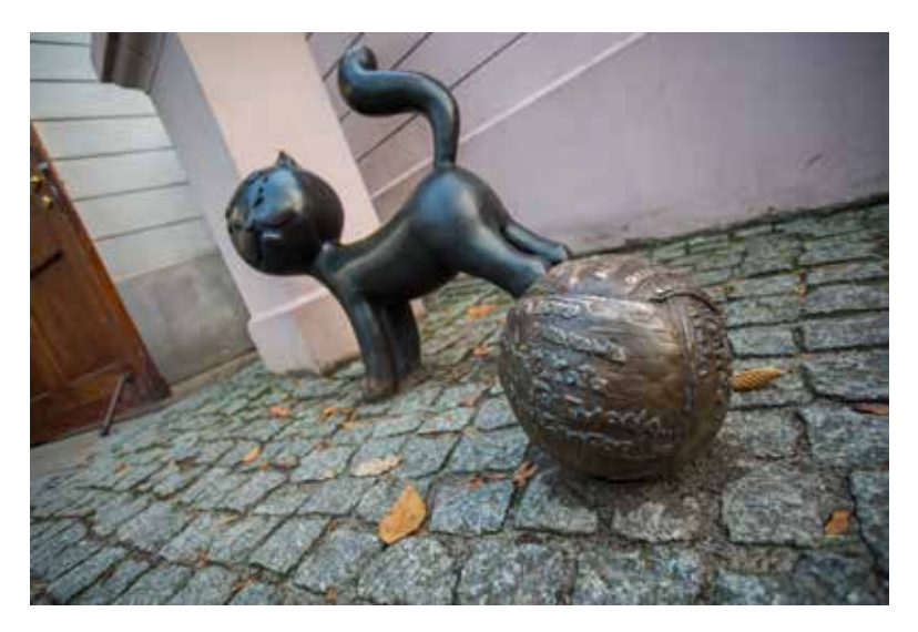
Fig. 3. The cat Bonifacy next to the entrance to the Film Museum

and scarves. The observations of how tourists react to the statuettes on Piotrkowska street lead to the conclusion that Miś Uszatek is treated with more affection than the people commemorated in the Walk of Fame. The teddy is a particularly likeable companion with whom to have a "selfie" photograph; it also invites interactive initiatives taken mainly by the city inhabitants, such as dressing the figure in seasonally appropriate attire. In a similar vein to the bench statues, the affinity with the sculpture is embedded in the idea of the monument; as such this affinity is not an iconoclastic act, but a gesture of affection.