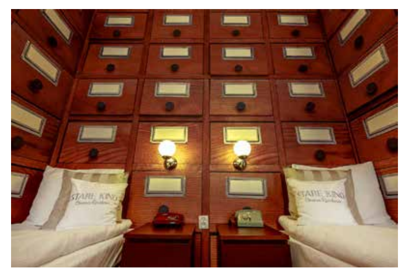
Fig. 4. The Kingsajz Suite in the Stare Kino Cinema Residence, promotional materials provided by Stare Kino Cinema Residence

on the facade with the information that 120 Piotrkowska street was the address of Poland's first permanent cinema theatre. Investors took the initiative to pick up this thread and acquired one of the annexes, which was opened in October 2013 as the hotel Stare Kino Cinema Residence. The 22 hotel rooms were designed in such a way as to refer to films shot in Łódź.<sup>43</sup> The hotel suites were named after film titles such as Wajda's classic film set in Łódź, i.e. The Promised Land , or the extremely popular Polish television series – Czterej pancerni i pies ( Four Tankmen and a Dog , 1966-1970) and Stawka większa niż życie ( Stakes Larger than Life , 1967-1968) – and such recent productions as Aleja gówniarzy ( Absolute Beginner , 2008) by Piotr Szczepański and the series Commissaire Alex (2011-2016).