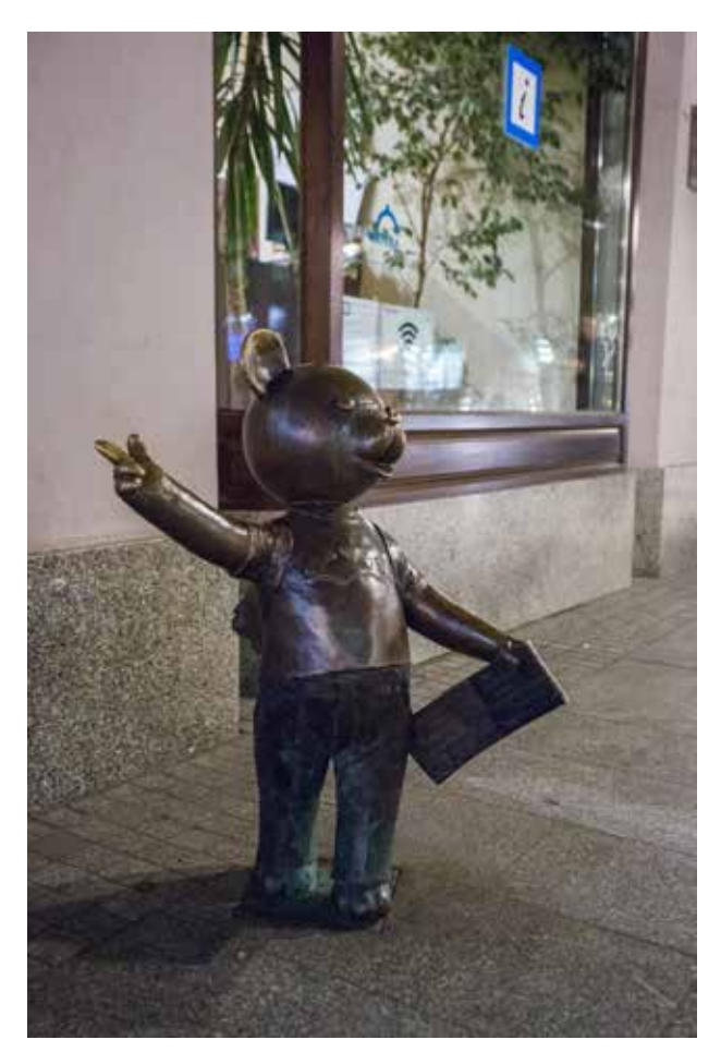
Fig. 2 The Floppy Bear on Piotrkowska street, fot. Aneta Bochnacka

the accomplishments of the Łódź school of animation."<sup>22</sup> The statuettes of fairy tale characters are scattered in various places in Łódź: Ćwirek Sparrow in front of the entrance to the Palm House, the cats Filemon and Bonifacy in the courtyard of the Film Museum, and Pik-Pok Penguin near Fala, a municipal water park. The first statuette to be unveiled was Miś Uszatek (literally: Teddy Floppy-Ear), a fairy tale character also known outside of Poland, which stands near the entrance to the Tourist Information Point at 87 Piotrkowska street.<sup>23</sup> The initial idea was to place a star dedicated to Miś Uszatek on the pavement of Piotrkowska street in a similar vein to the Hollywood Walk of Fame, where fictional characters such as Mickey Mouse or Donald Duck have their own stars bearing their names. The members of the committee of the Łódź Walk of Fame quashed this initiative arguing that it was incompatible with the serious character of the project.